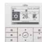
Wired Remote Controller (High grade)