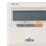
Wired Remote Controller