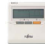
Wired Remote Controller