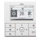
Wired Remote Controller (High grade)