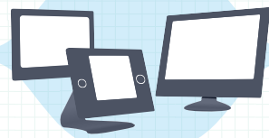
Home Automation / BMS